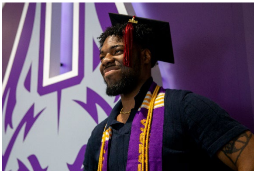
College of Integrated Health Sciences