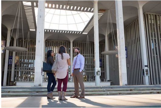
College of Arts & Sciences