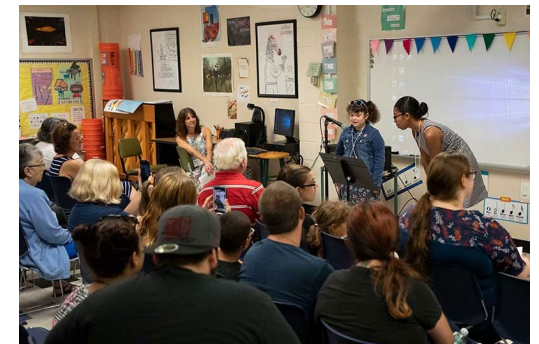
School of Education