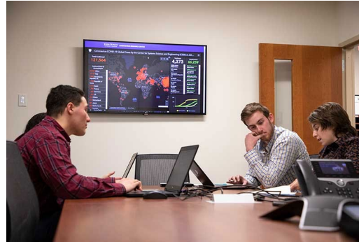
College of Emergency Preparedness, Homeland Security & Cybersecurity