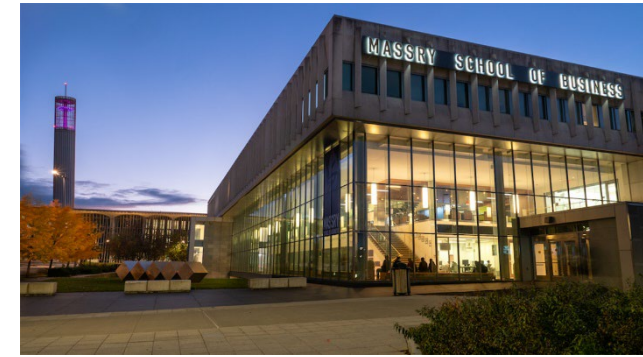
Massry School of Business