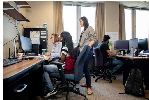
College of Nanotechnology, Science, and Engineering