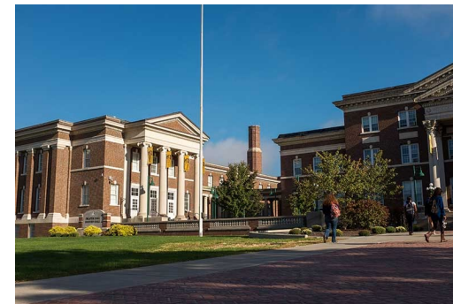
Rockefeller College of Public Affairs & Policy